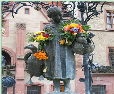
Goose Girl statue Göttingen, Germany