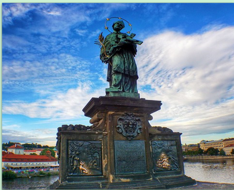
St. John of Nepomuk statue Charles Bridge, Prague Czech Republic