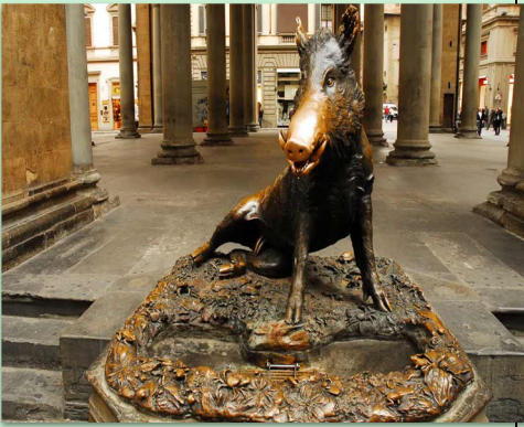
Il Porcellino Florence, Italy