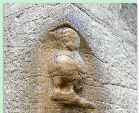
Magic Owl of Dijon, Dijon, France