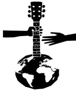
World Music Therapy Day MARCH 1

March 1 st , World Music Therapy Day is a day for people all around the world to celebrate the healing power of music. People have always known and spoken about the power and benefits of music. Music therapy exists as a clinical field. Music therapists use music to help people, especially children, people with disabilities, the elderly.