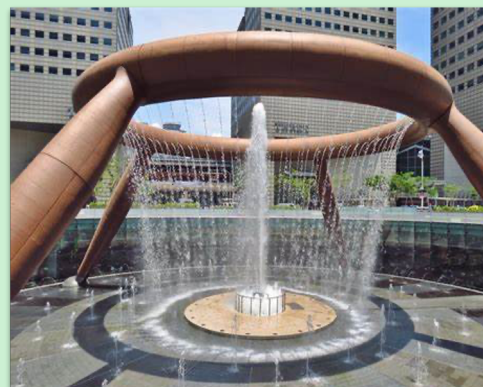
Fountain of Wealth, Suntec City, Singapore