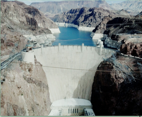
Winged Figures of the Republic Hoover Dam, Nevada, USA