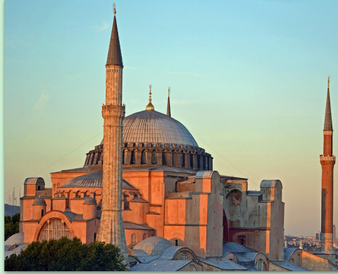
Weeping Column, Hagia Sophia, Istanbul Turkey