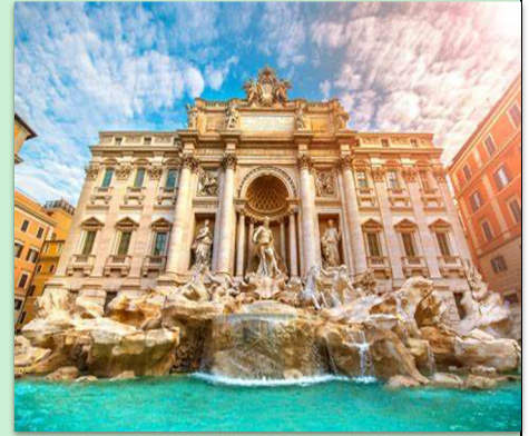
Trevi Fountain Rome, Italy