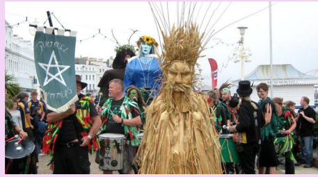
Lammas Festival, UK The first wheat harvest in England, Scotland, Wales and Northern Ireland, August 1 st