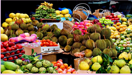
Chanthaburi Fruit Fair of exotic fruits, Chanthaburi, Thailand, Late May