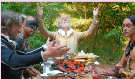
Thanksgiving , Plimoth Plantation, Massachusetts 3-day feast commemorating the Pilgrims' first successful wheat crop