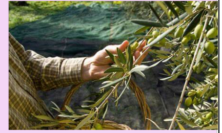
2-day celebration of Olive Harvest in November Olivagando, Magione, Italy