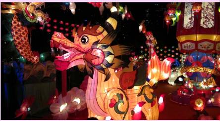
Mid-Autumn Festival , China, Taiwan and Vietnam Mid-September