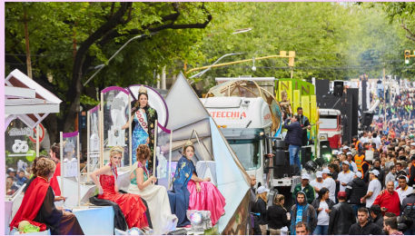
National Grape Harvest Festival Vendimia, Mendoza City, Argentina Late February