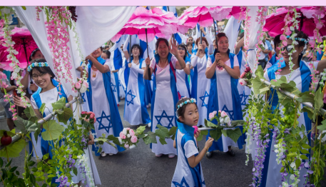
Sukkot Jewish Festival giving thanks for Fall harvest, Israel September/October