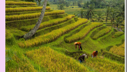
Rice Harvest , Bali, Indonesia Following the New Year