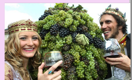
Znojmo Wine Harvest Festival , South Moravian Region of the Czech Republic Mid-September