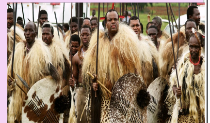
First fruit ceremony Incwala, Eswatini, South Africa Late December