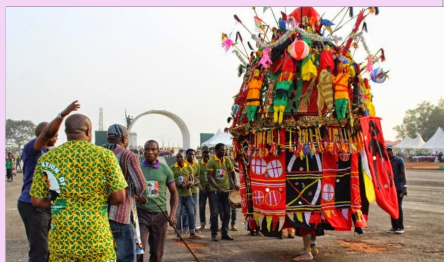
Yam Festival , Ghana, South Africa Celebrating yam crop in August/September , with similar festivities in Papua New Guinea and Nigeria