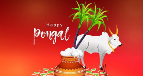
A mid-January Hindu Harvest festival Pongal, Tamil, India