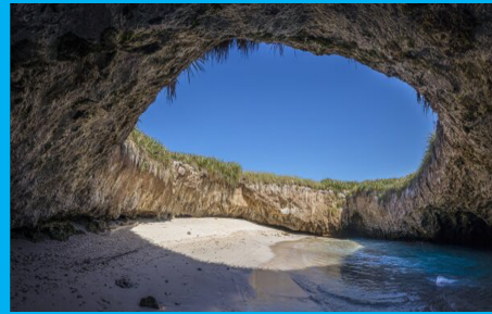
Hidden Beach Marietas Island, Mexico