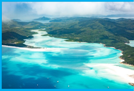
Whitehaven Beach Whitsunday Island, Australia