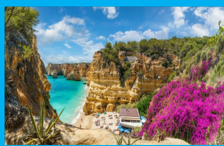
Marinha Beach Lagoa, Portugal