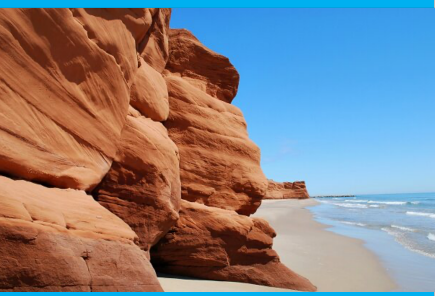
South Dune Beach House Harbour Island, Quebec