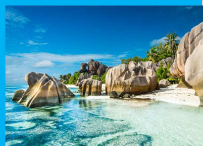
Anse Source d'Argent La Digue, Seychelles