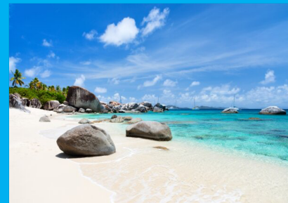
The Baths, Virgin Gorda, British Virgin Islands