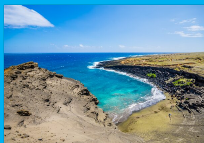
Papakolea Beach Big Island, Hawaii