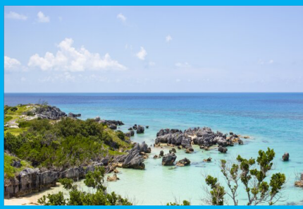
Horseshoe Bay Beach, Bermuda