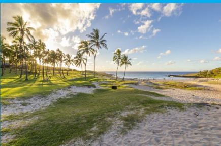
Anakena, Easter Island