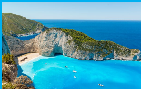
Navagio Beach Zakynthos, Greece